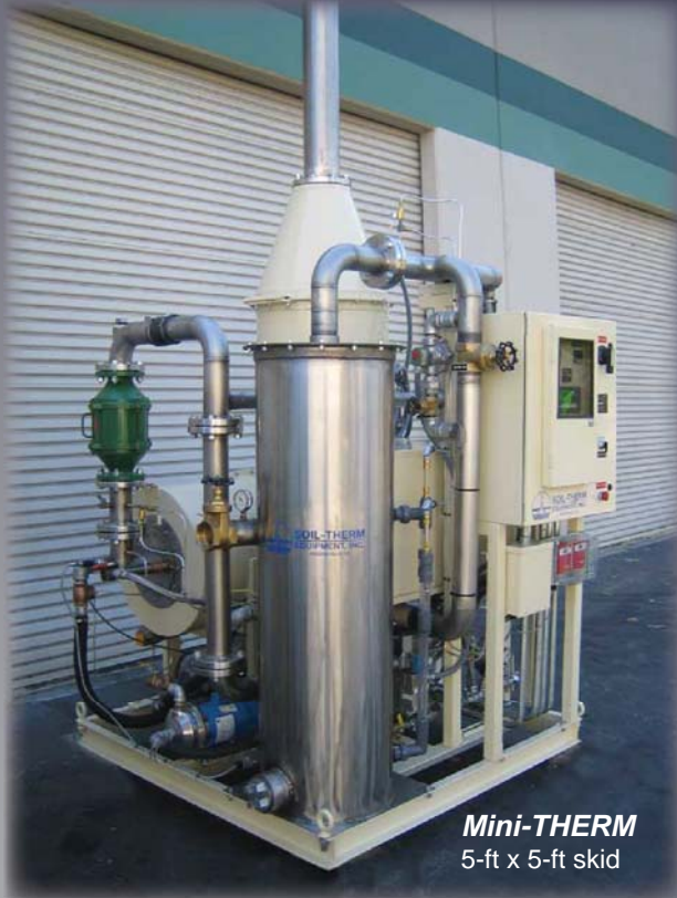
Mini-THERM 5-ft x 5-ft skid