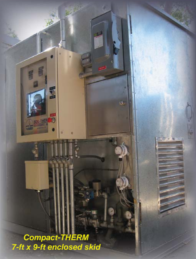
Compact-THERM 7-ft x 9-ft enclosed skid