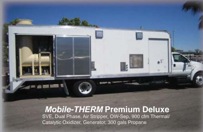
Mobile-THERM Premium Deluxe SVE, Dual Phase, Air Stripper, OW-Sep, 900 cfm Thermal/ Catalytic Oxidizer, Generator, 300 gals Propane