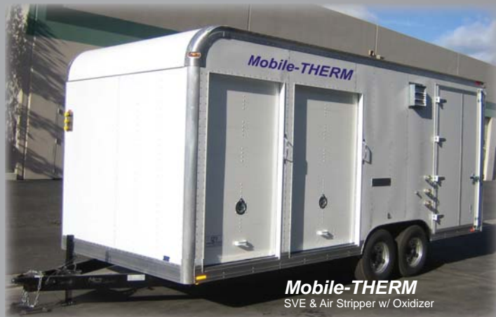
Mobile-THERM SVE & Air Stripper w/ Oxidizer