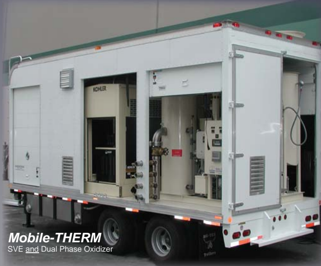
Mobile-THERM SVE and Dual Phase Oxidizer