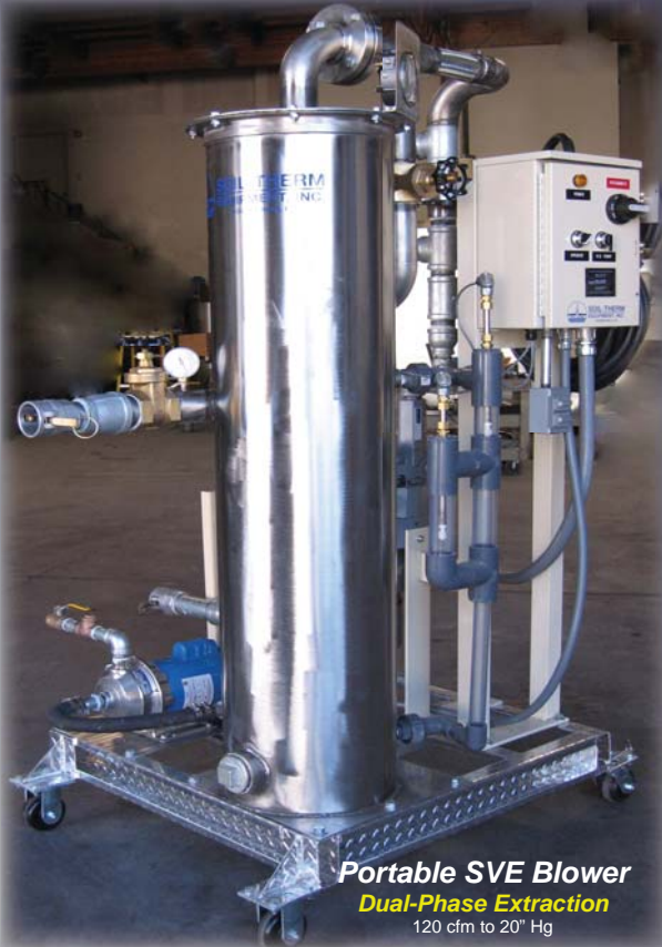
Portable SVE Blower Dual-Phase Extraction 120 cfm to 20" Hg