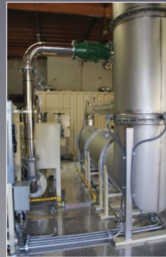
Smaller Sizes and Powerful Performance !