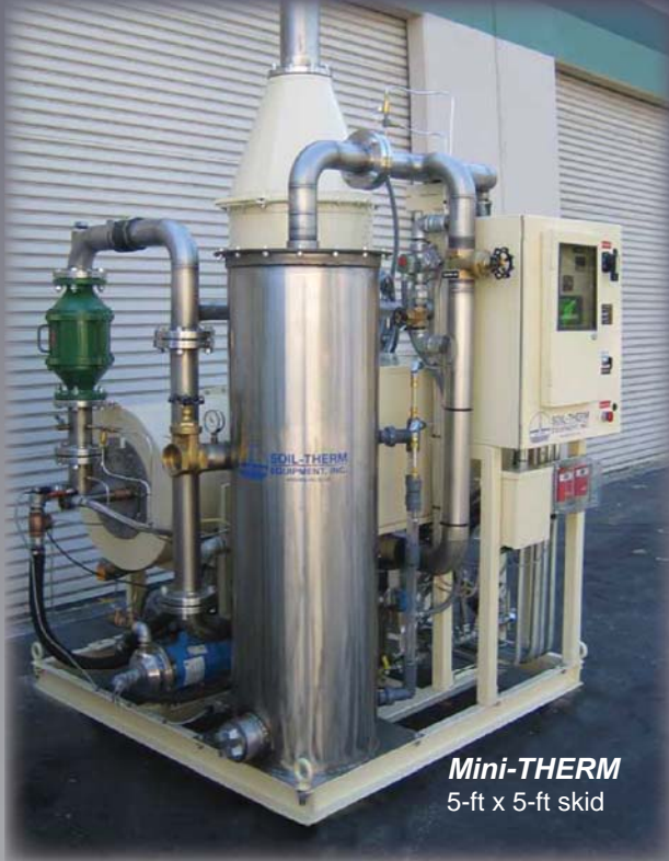
Mini-THERM 5-ft x 5-ft skid